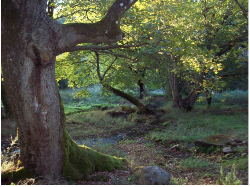
Grove believed to be sacred to Demeter

Today we will cross into the natural world of Arcadia and hike in the Foloi Forest , one of the largest old-growth forests remaining in Europe. The forest was the home of dryads and centaurs, named after Pholus , whose prematurely uncorked wine led to the drunken accident when Hercules wounded his mentor Chiron . We will also walk through the Gorge of the Centaurs surrounded by high green walls.