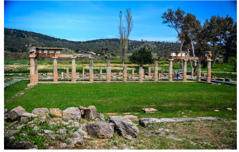
Sanctuary of Artemis at Brauron

We will then make the brief drive to Sounion , to witness the sunset from the Temple of Poseidon , as well as (skies permitting) the setting conjunction of the Moon and Venus.