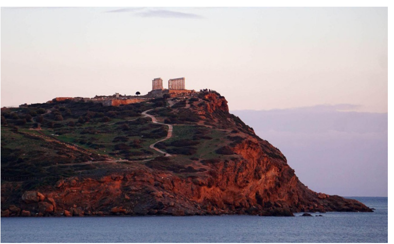
Temple of Poseidon at Sounion

The next morning after our first dream group, we will take the Panathenaic Way to the Parthenon, along the way visiting the Temple of Hephaestus and the Stoa . We will meet our guide at the Akropolis , visiting the many temples made in honor of Athena , including the Parthenon, the Erectheion, and the Temple of Athena Nike. We will also visit the Akropolis