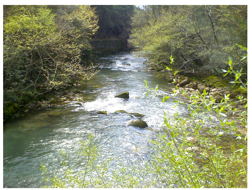
Ladon River

The next day, after our morning dream group we will visit the complex of the Archaia Olympia , the sacred precinct dedicated to Zeus , including the stadium and other sites of the Olympic Games. We will visit the Temple of Zeus , Temple of Hera , and the Herakleion Sanctuary , said to be founded by Hercules in honor of Zeus, under the nearby Hill of Chronos his father.