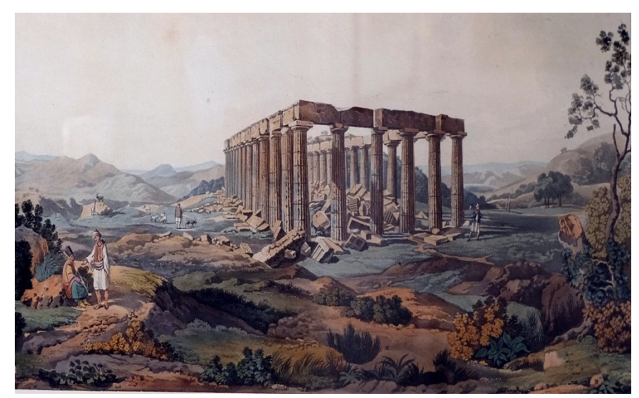
Temple of Apollo at Bassae, Photo E. Dodwell

Following our morning dream group, we will depart from the seaside and begin making our way to Arcadia. In the mountains along the way is the sanctuary of Bassae, where we will visit the magnificent Temple of Apollo at Bassae, one of the most well-preserved temples due to its relative remoteness in the Arcadian hills. Apparently forgotten for