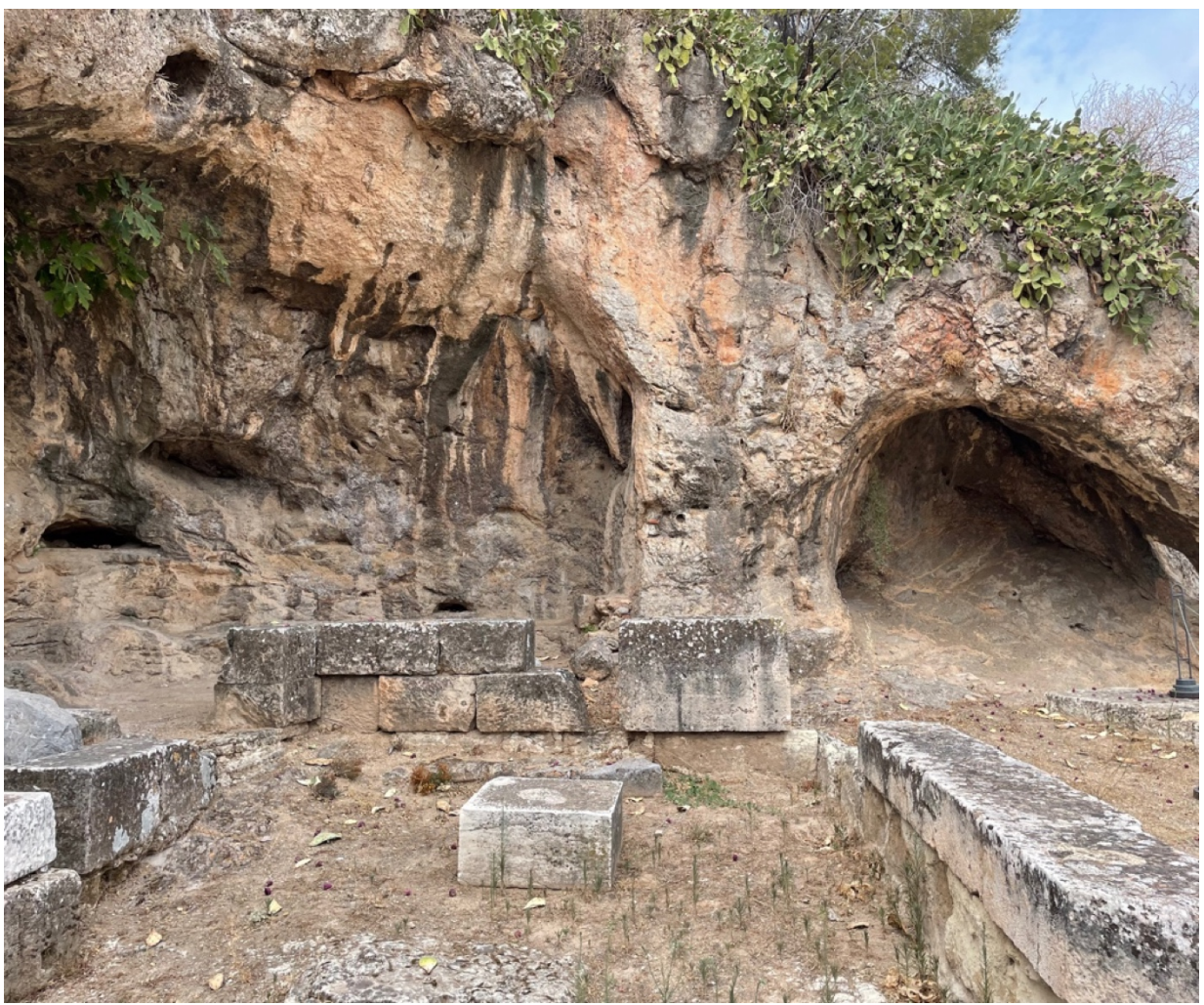
Cave of Hades at Eleusis

In the morning we will depart from Athens, following in the steps of many initiates who walked the 'Sacred Way' to Eleusis , site of the Eleusinian Mysteries where for a thousand years the story of Demeter , Persephone , and Hades was shared in a manner so profound that it escorted those who participated across the threshold into full initiation.