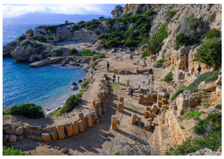
Heraion at Perachora

The next day, after our dream group in the morning, we will visit the Heraion of Perachora , a beautiful sanctuary on the Gulf of Corinth, connected to older and rural cults of the goddess. Along the way we will also visit the town of Loutraki and on our way back to our final evening in Nauplion, we will stop by the Kanathos Spring , where Hera is said to have bathed each year, and to become a maiden once more.