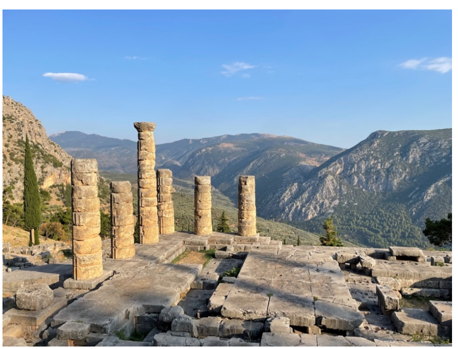
Temple of Apollo at Delphi

The next morning, we will then proceed to the site of the Oracle, passing by the Omphalos, navel of the world, and then walking the path the ancients took to the Pythia. Following our time at the site we will visit the remarkable Delphi Museum and its many treasures, and have a free evening in Delphi.